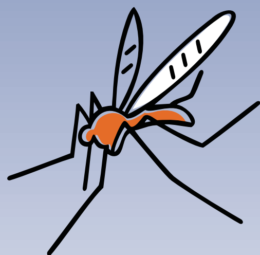
Prevention of mosquito bites (DEET)